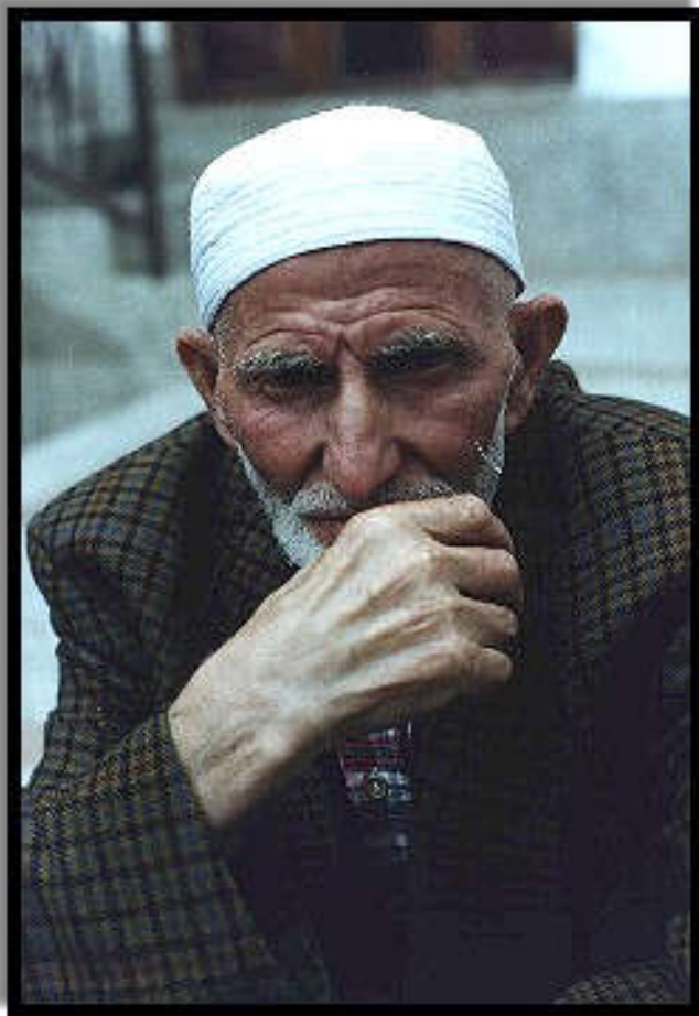
This man in Prizren is listening to accounts of atrocities that his neighbors had to undergo.