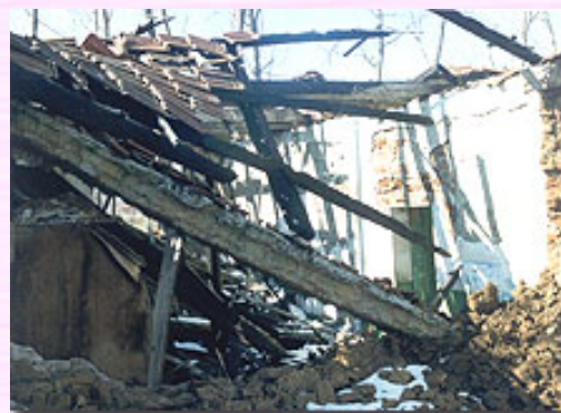
The Smolice school was completely destroyed in the war

The village's primary school was completely destroyed during the war. The remains of the old building (pictured above) was removed and with funding from the German Technical Corporation (GTZ), AMURT is building a brand new school. After the summer the children will finally be able to attend school in their own village again.