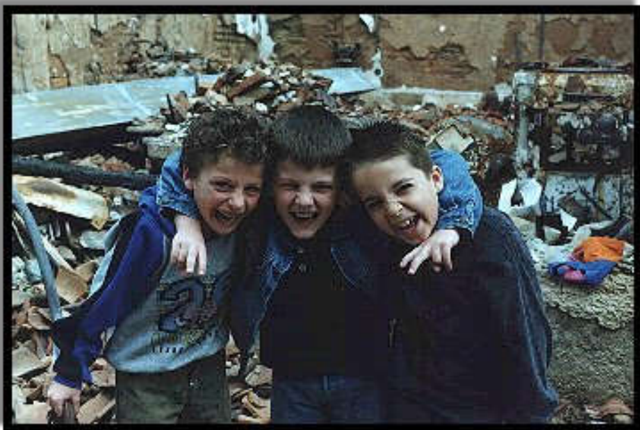
Children having fun amidst the rubble.