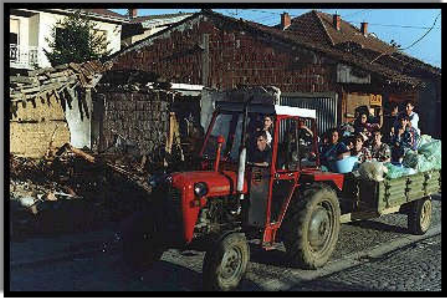
Newcomers freshly arriving in town. Happy, tired, shocked. Will their house still be standing?