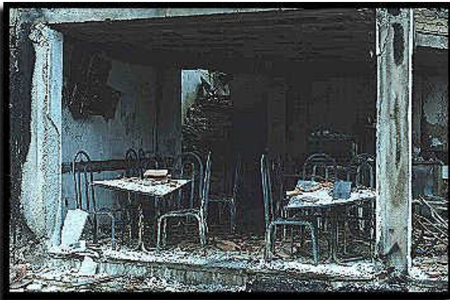
Formerly a popular meeting point, this cafe in the main square in Gjakova offers a bizarre sight.

The photos are un-cropped and the captions are from his original notes.