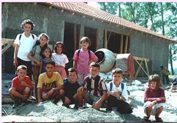
Some of the future students visiting the construction site

The village's primary school was completely destroyed during the war. The remains of the old building (pictured above) was removed and with funding from the German Technical Corporation (GTZ), AMURT is building a brand new school. After the summer the children will finally be able to attend school in their own village again.